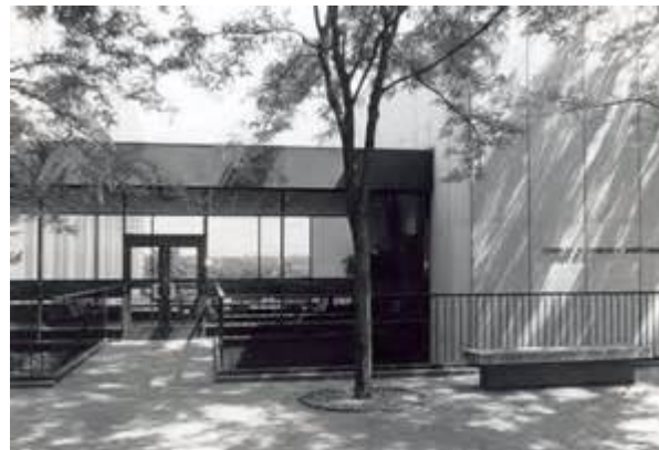
Entrance to Babcock Auditorium